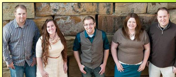
Family Heritage July 22 & 23